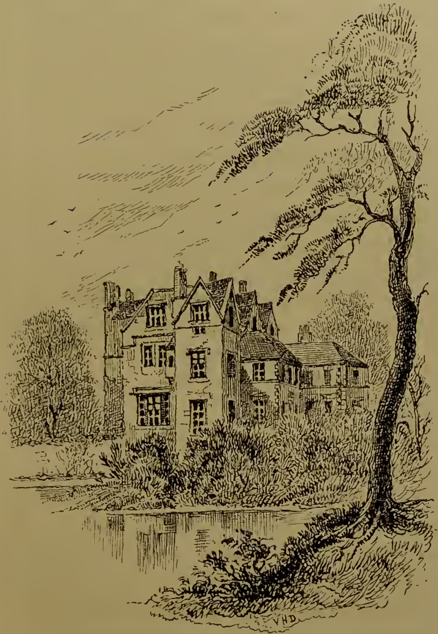
BREADSALL PRIORY, WHERE ERASMUS DARWIN DIED.